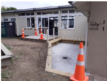
Behind Room 1