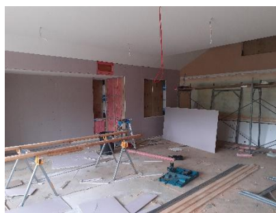
The interior of Room 3 - ready for gib stopper & painter